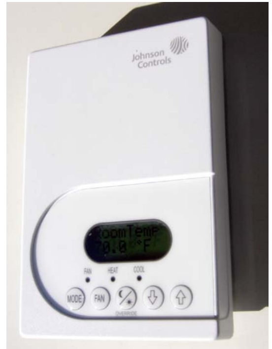
Optional Auto-Variable Speed Thermostat Surface Mounted – 3.5" W x 5" H x 1¼" D Requires 4 Low Voltage Conductors

Example: Design 98 DB / 62 WB, 0.1" ext. static, 98 - 62 = 36 , 36 * 0.95 = 34.2 , 98 - 34.2 = 63.8 °F Product Air Temperature \approx Design WB + 2 = 64 °F